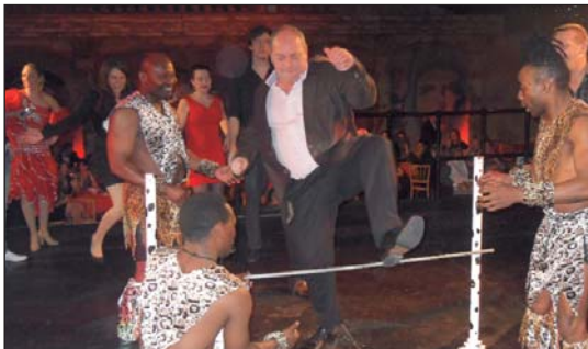
Above: Who says fat men can't limbo?

DESPITE the snow that hit the whole of the country in December the WJ Linkline Group Christmas party was still able to go ahead although many from the South West depot were actually snowed in!